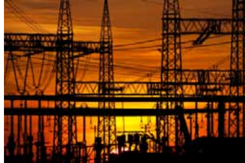
After storms damaged NPPD's transmission lines and high temperatures increased the demand for power last summer, emergency action was needed to keep the power grid stable.

is just one of the plans NPPD has in place during emergency situations," said Arlt. "I am very pleased by the response we received from the participants and want to thank our wholesale customers for their efforts. This is a great example of public power working together."